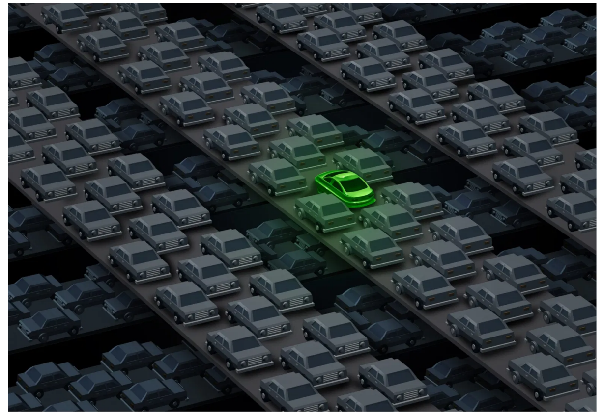
Despite a $300 million state investment, hydrogen transportation has lagged.